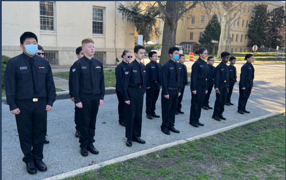
League Cadets at Inspection